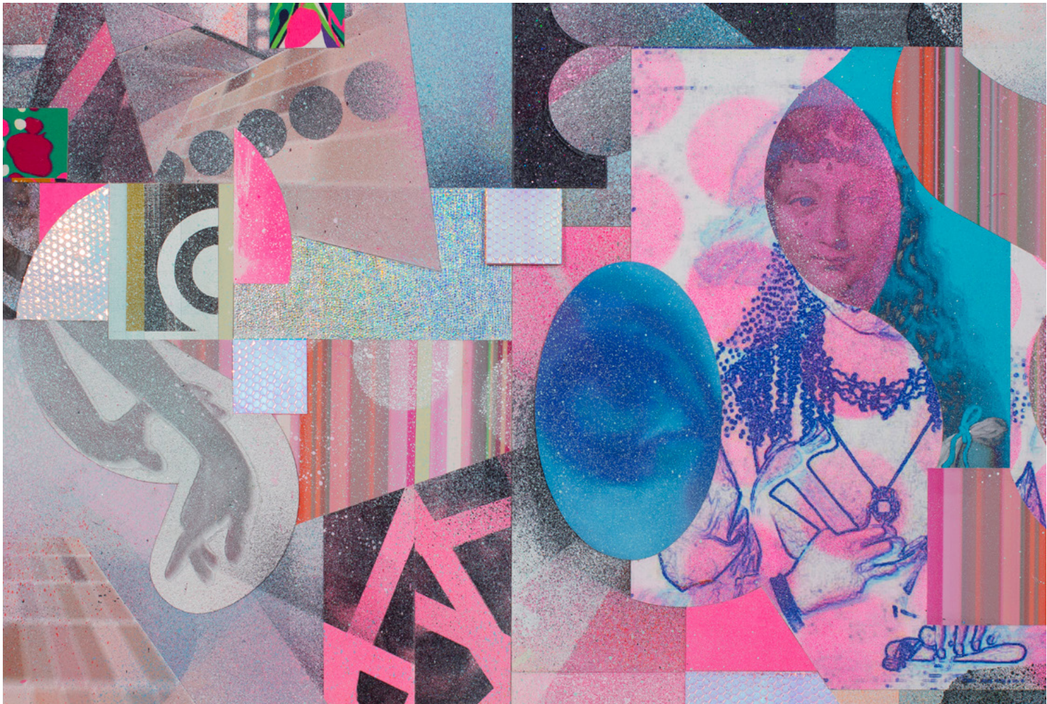
Shimmer Palace, 2022 (detail)

Digital prints, acrylic paint, oil paint, glitter, fabric, vinyl on wood and Dibond 61 x 83 inches