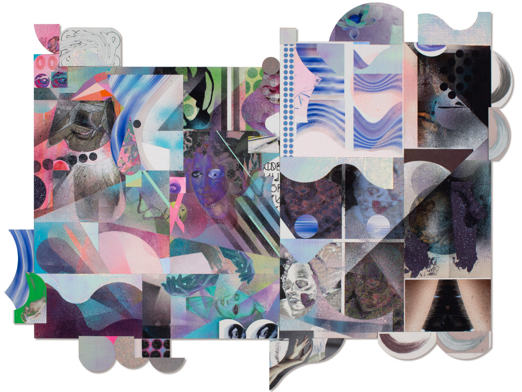
Her Regal Bearing, 2022 Digital prints, acrylic paint, glitter, fabric, vinyl on wood and Dibond 60.25 x 78.5 inches