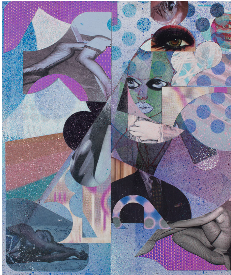
Resplendent, 2022 Digital prints, acrylic paint, glitter on Dibond 24.5 x 20.5 inches