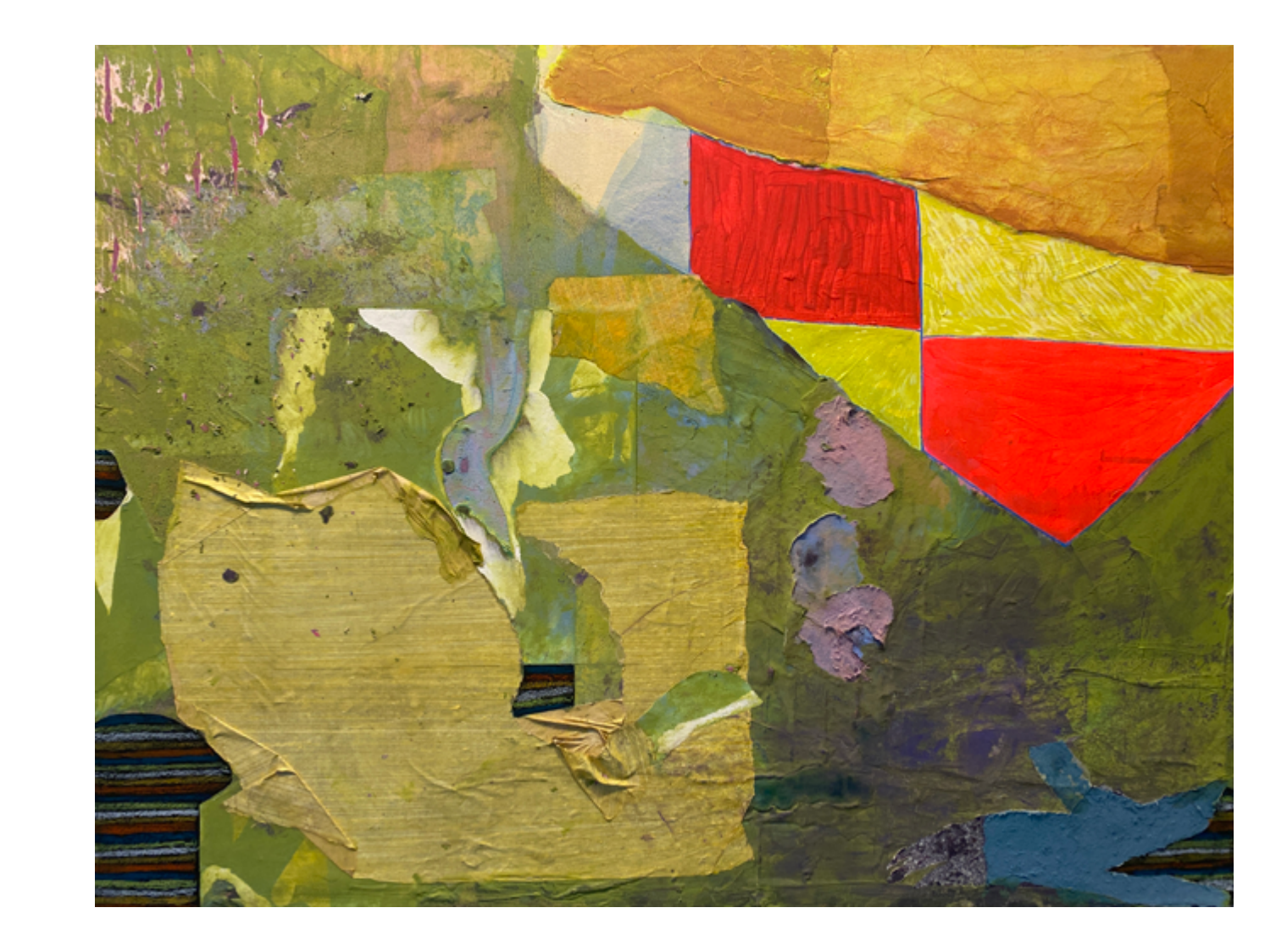
Ineffable Patterns #20, 2023 Acrylic, paper, flashe and crayon on canvas 30 x 40 inches