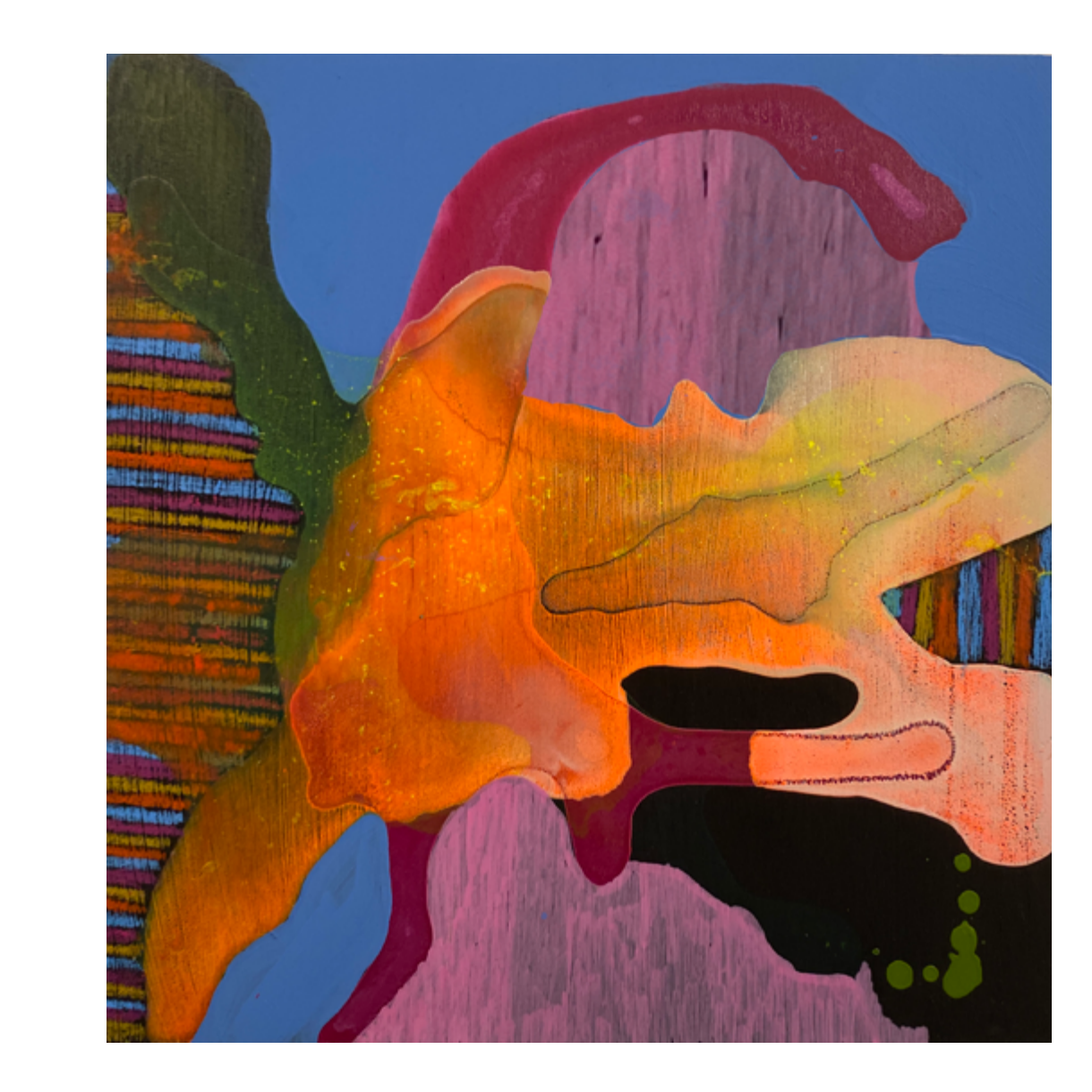
Finding Space #10, 2023 Acrylic, marker and crayon on wood panel 42 x 40 inches