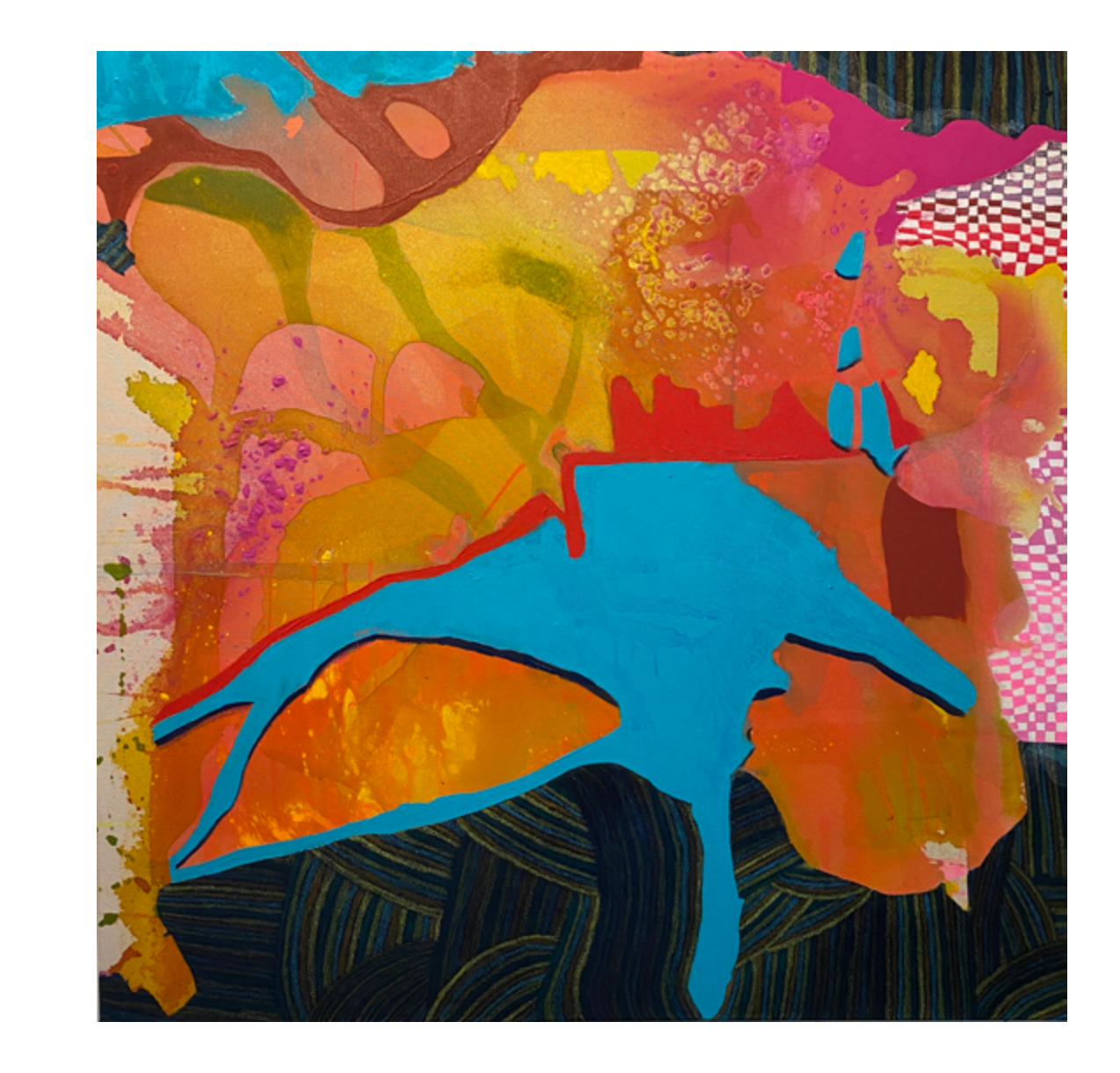
Finding Space #8, 2023 Acrylic, crayons, marker and flash on canvas 42 x 42 inches