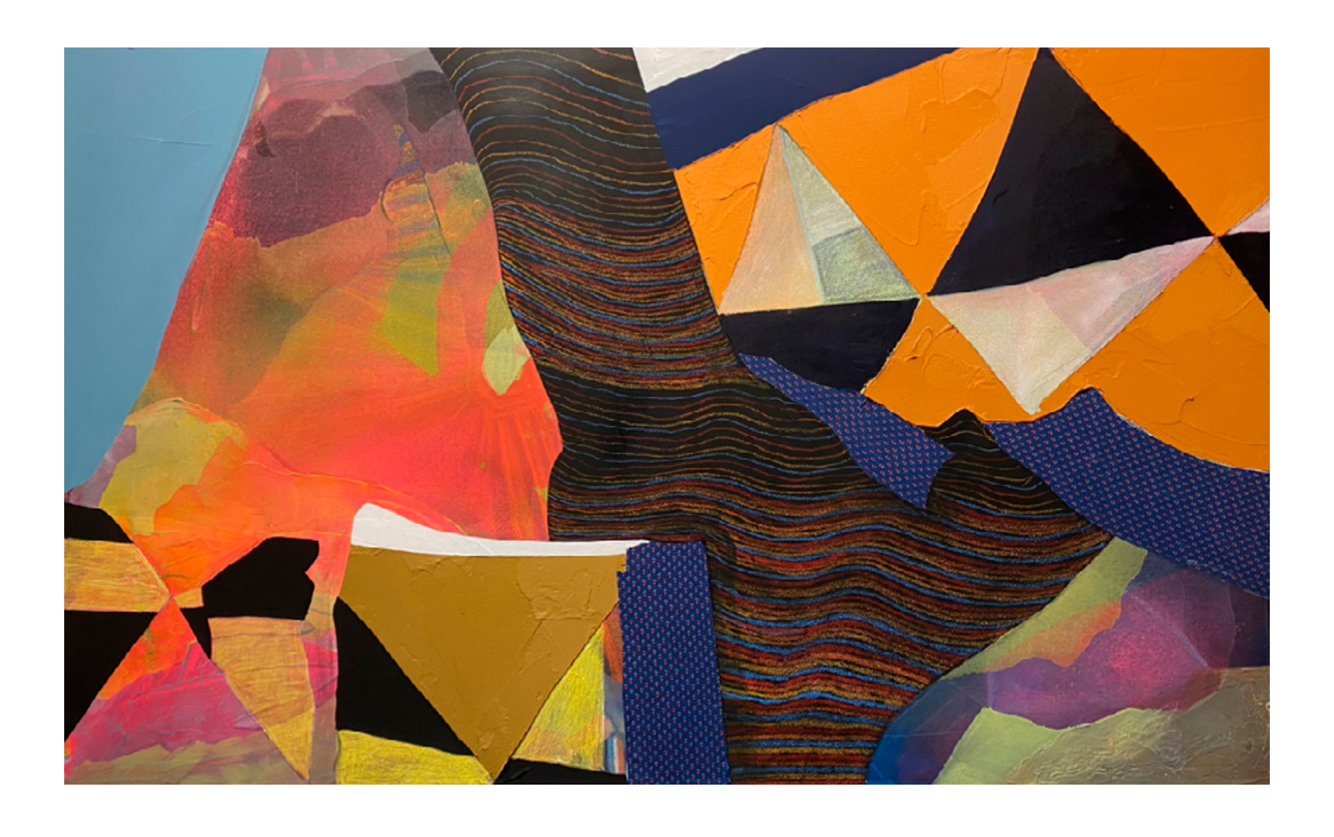
Ineffable Patterns #14, 2022 Acrylic, fabric, crayon, gesso, and flashe on canvas 42 x 40 inches