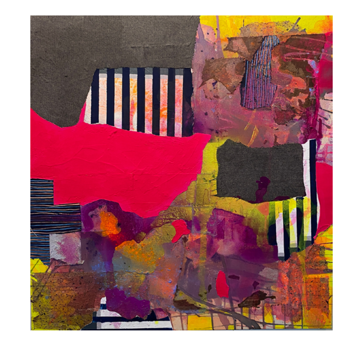
Finding Space #6, 2023 Acrylic, markers, crayons, flashe, paper and fabric on canvas 42 x 40 inches