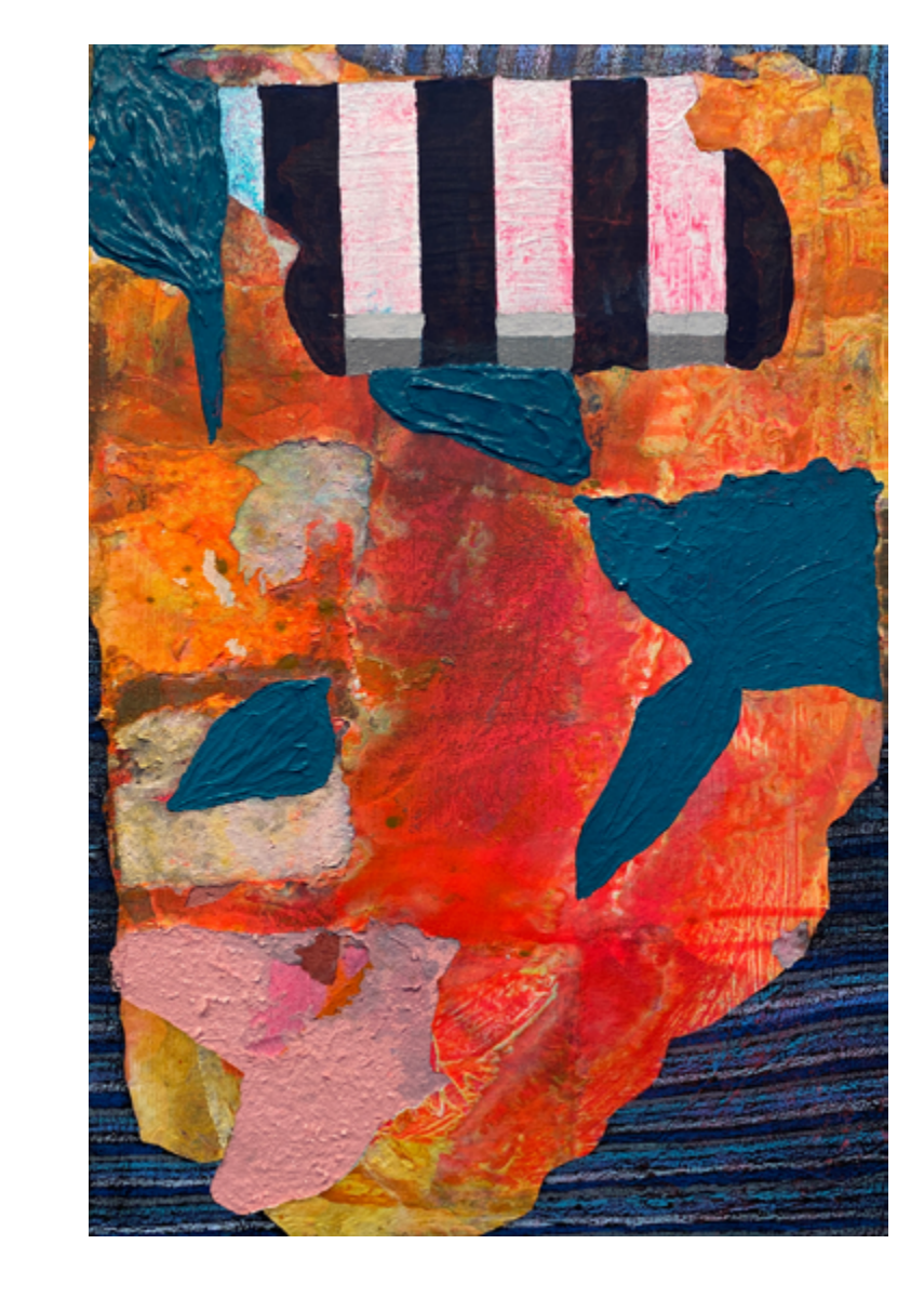
Finding Space #3, 2023 Acrylic, markers, crayons, flashe and paper on canvas 24 x 16 inches