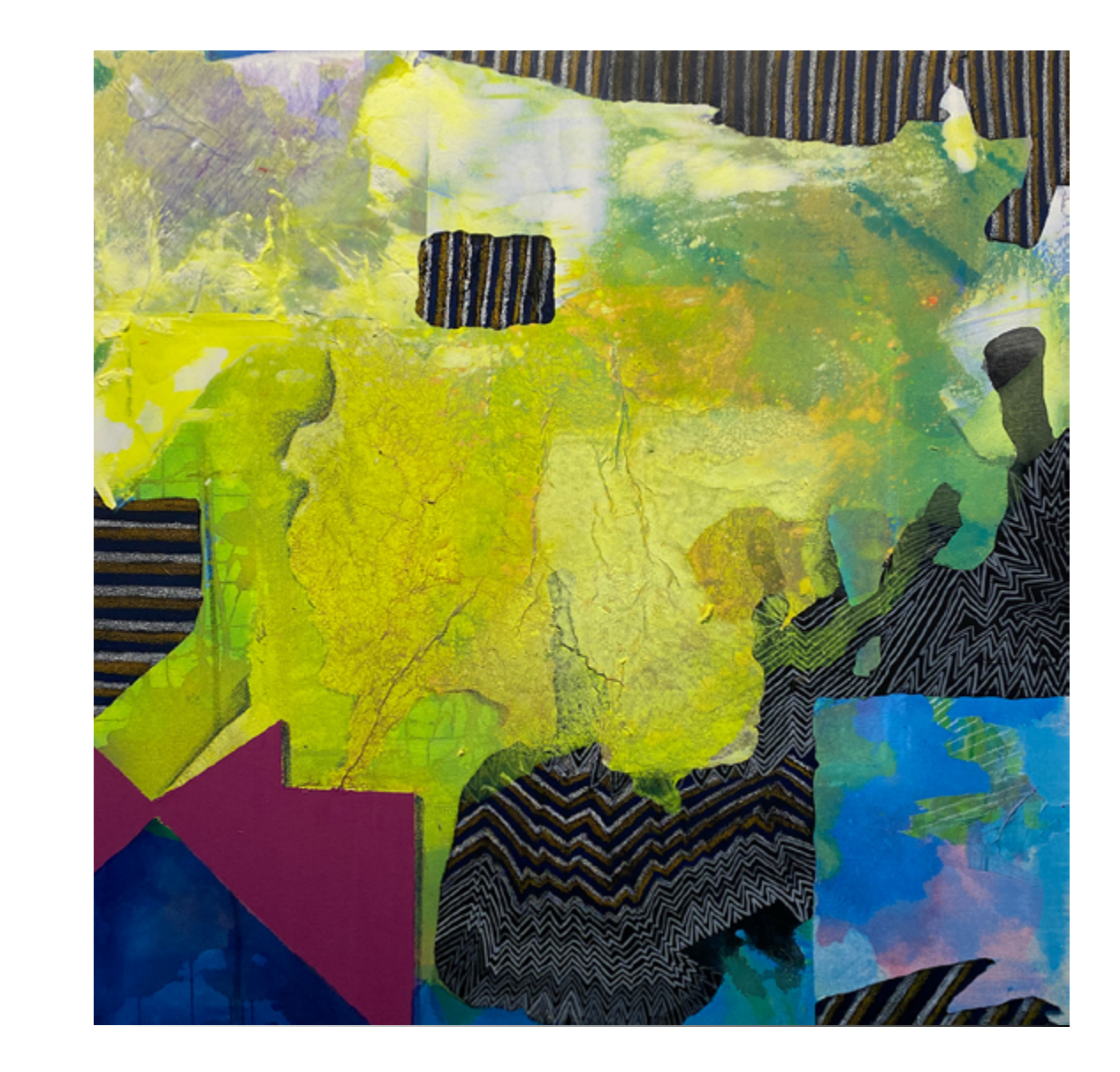
Finding Space #5, 2023 Acrylic, crayons, flashe and paper on canvas 40 x 40 inches