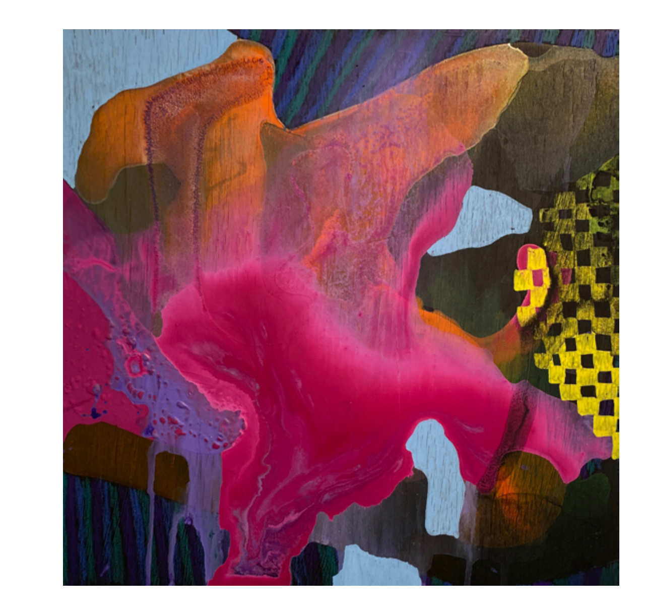
Finding Space #9, 2023 Acrylic, marker and crayon on wood panel 12 x 12 inches