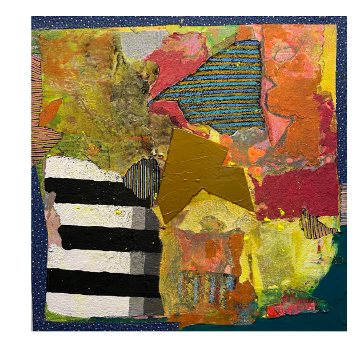
Finding Space #1, 2023 Acrylic, markers, crayons, flashe, paper and fabric on canvas 20 x 20 inches