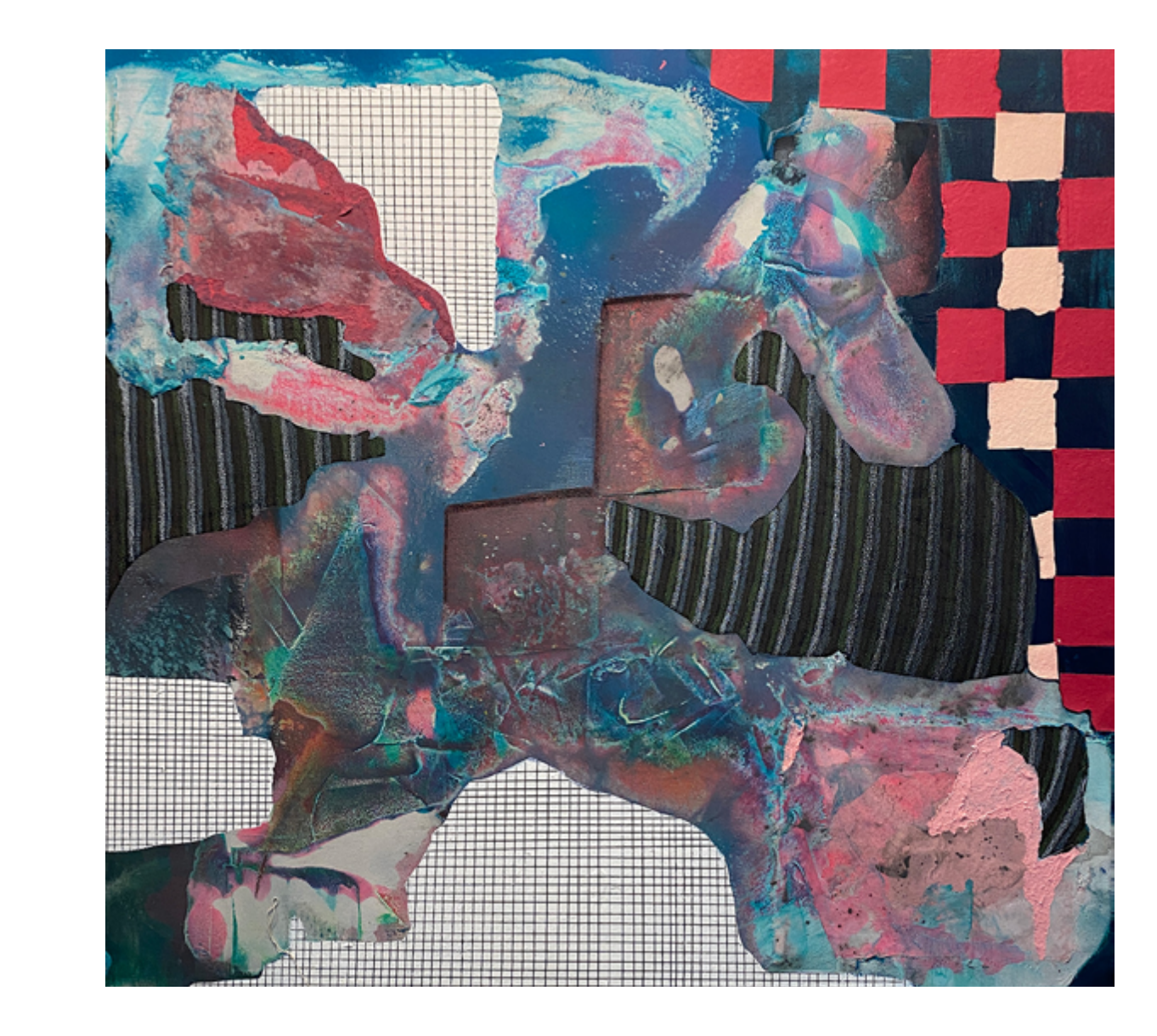
Finding Space #7, 2023 Acrylic, crayons and flashe on canvas 38 x 35 inches