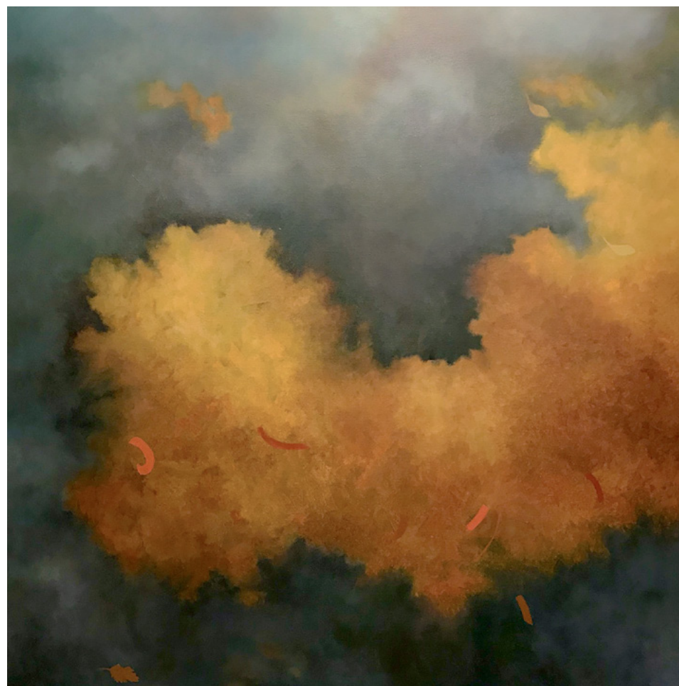
Janis Goodman Floating Autumn 2018 Oil on canvas 60 x 60 inches