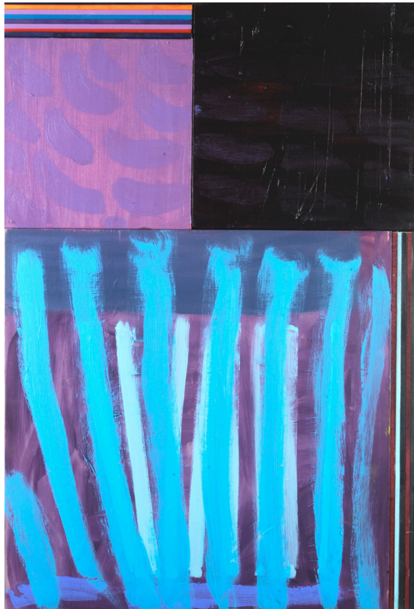
Carrie Patterson Total Station No. 4 2018 Acrylic and oil on canvas and wood 34 x 24 x 3 inches