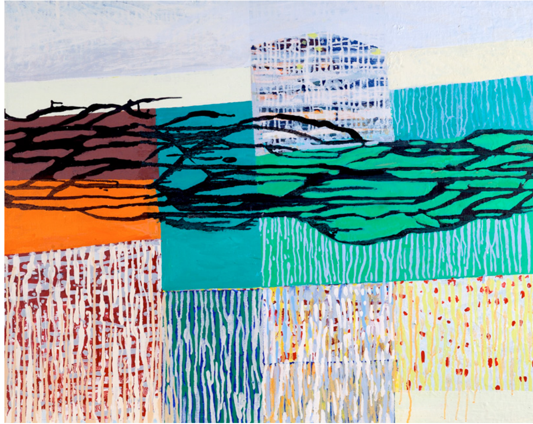
Cecily Kahn Currents 2010 Oil on wood 24 x 34 inches