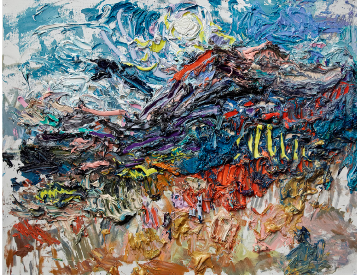
Ying Li Telluride Mountains #1 2018 Oil on linen 22 x 28 inches