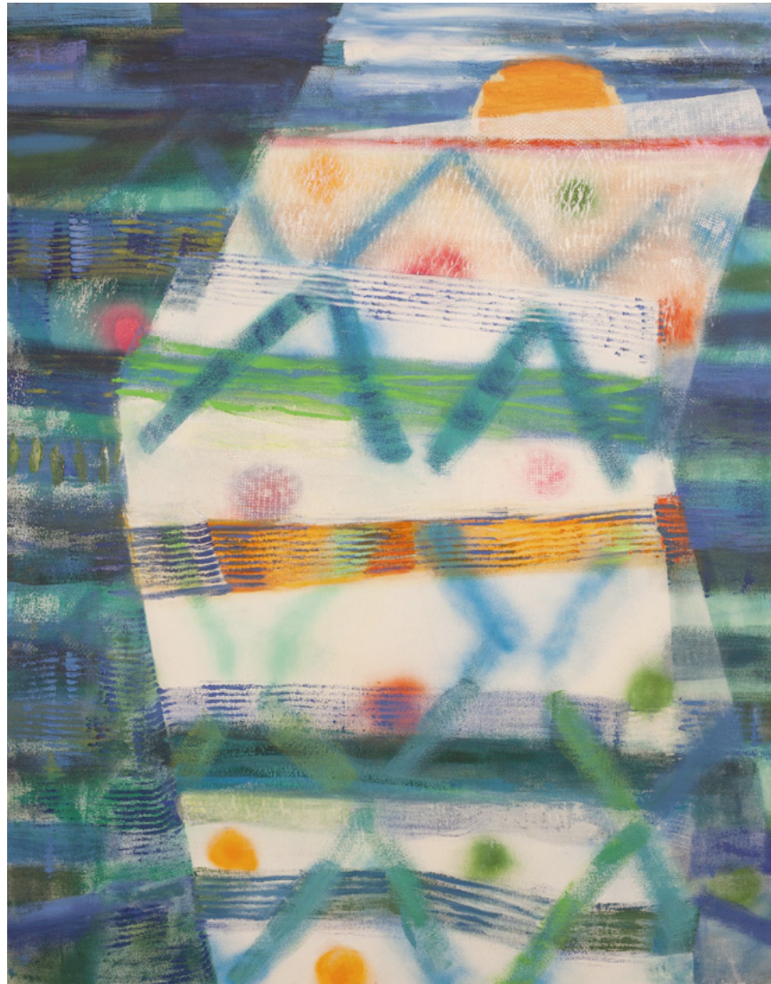
Kayla Mohammadi Sunset III 2015 Acrylic and oil on canvas 59 x 45 inches