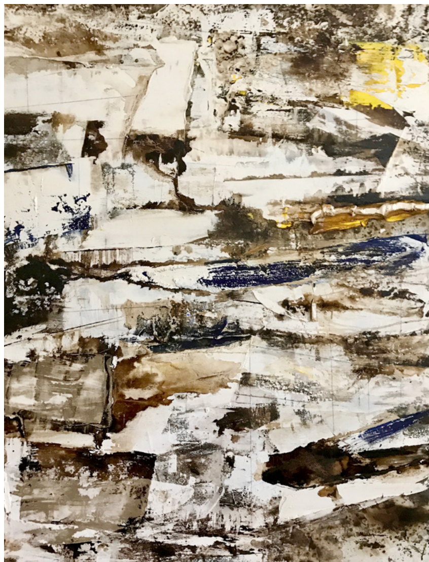
Kendra Wadsworth Push 2017 Oil, tar, graphite on canvas 48 x 36 inches