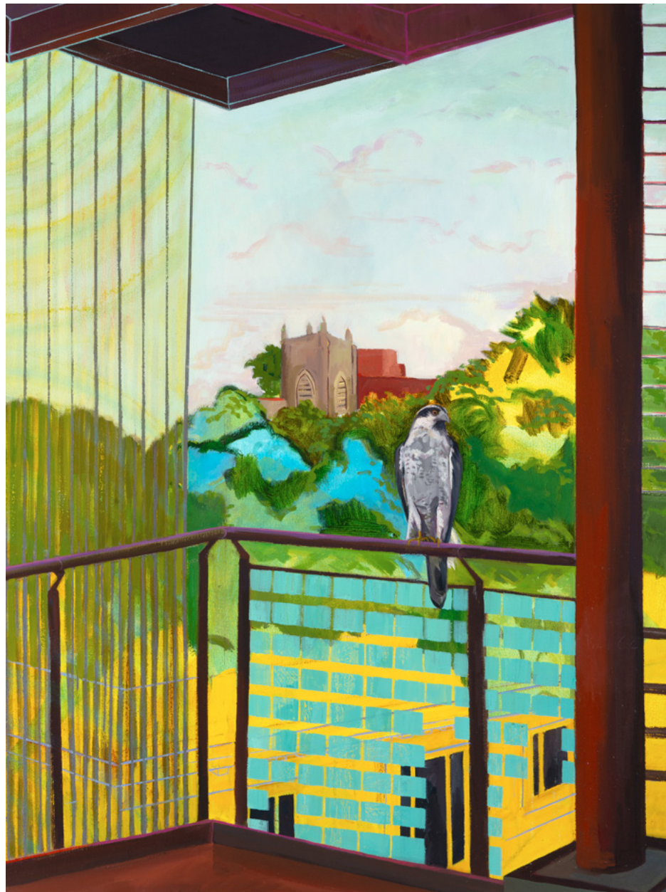
Deirdre Murphy Edgeland II, Looking In 2019 Oil on canvas 40 x 30 inches